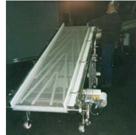
Incline Fines Reclaimer Conveyor