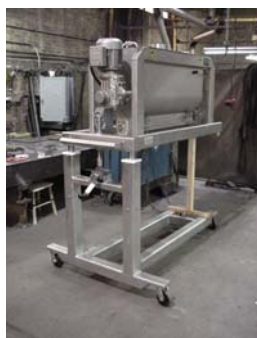
Salt applicator mounted on adjustable height C-Frame