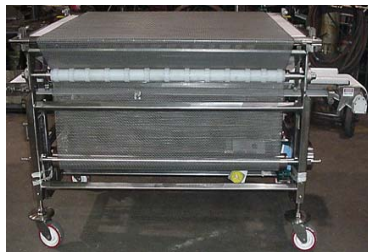
Salt Reclaimer Conveyor, wire mesh with retractable discharge noser.